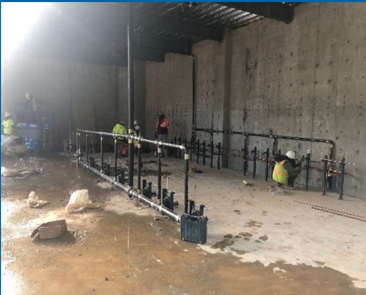
Gymnasium Plumbing Rough In