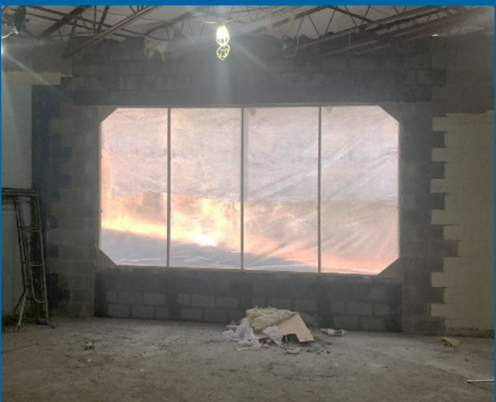
North Wing Steel/CMU Complete and Shoring Removed