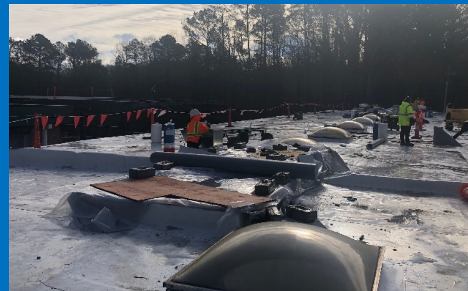
TPO Roofing Replacement