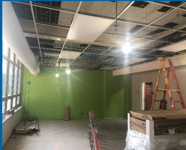
SW Wing Ceiling Grid and MEP Trims