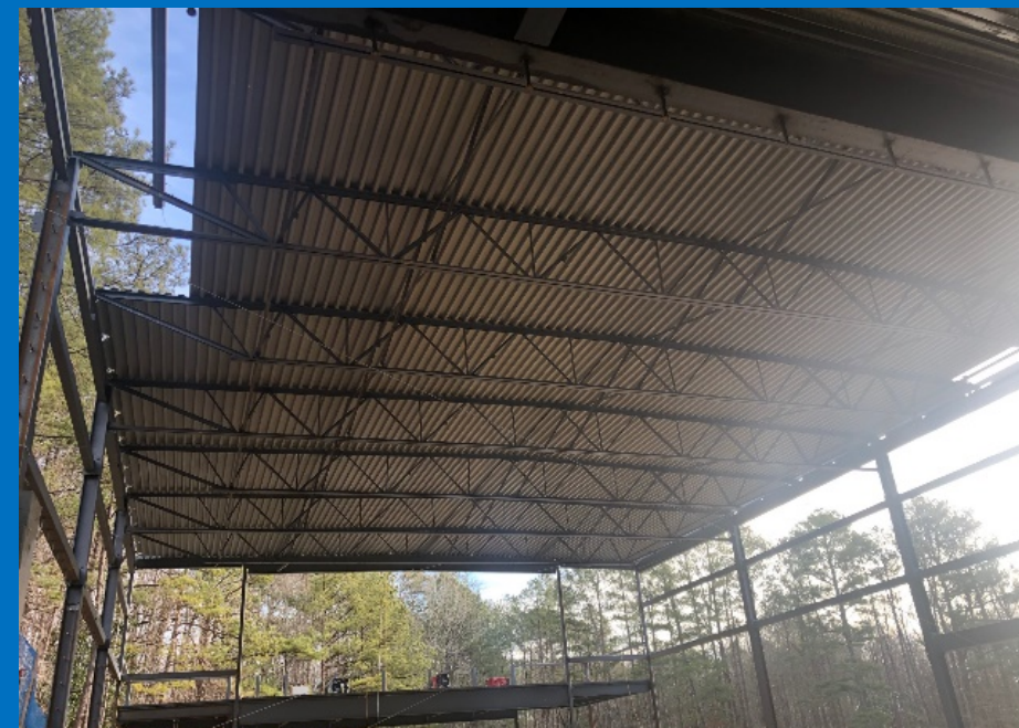
Gymnasium Roof Decking