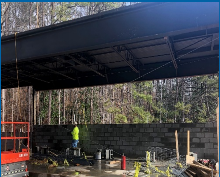
Gymnasium Exterior CMU Walls