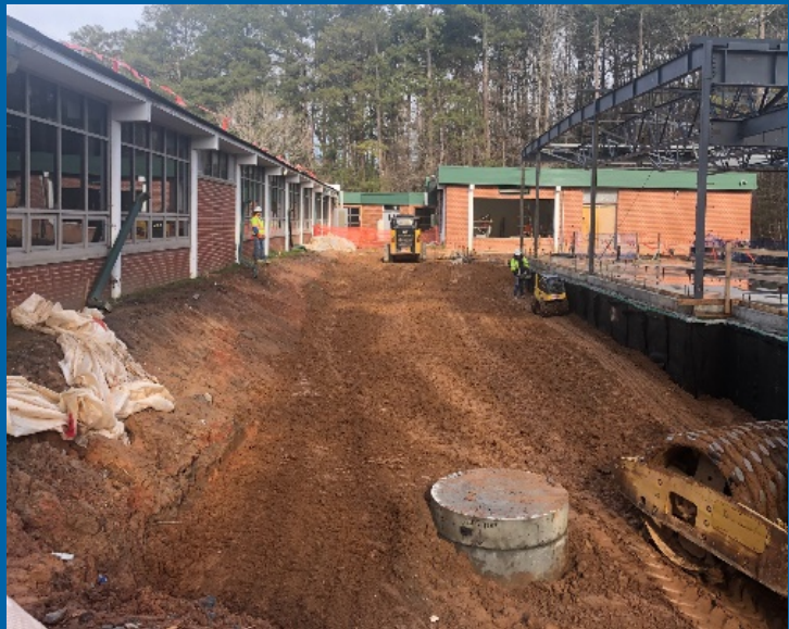
South Gymnasium Wall Backfill